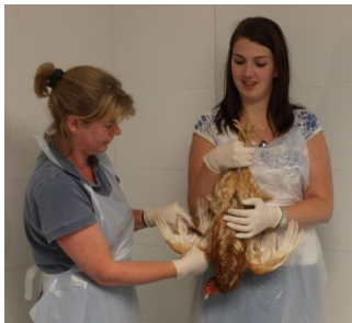
How to hold a bird for sampling

The required minimum amount is 1 ml. If several tests are being carried out then more blood is required. A full tube is perfect to cover all eventualities.