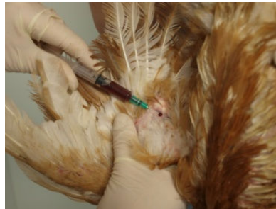
Using a syringe and needle