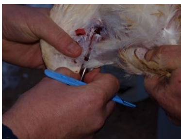
Using a scalpel blade